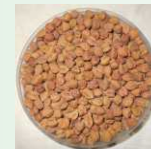
Kota Desi Chana-2