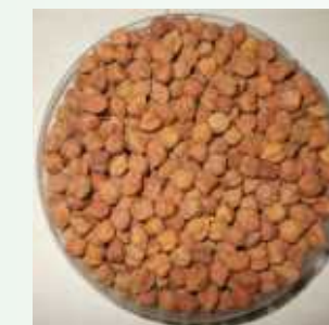
Kota Desi Chana-3